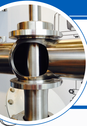
Infuze Cooker heart of the SilverLine